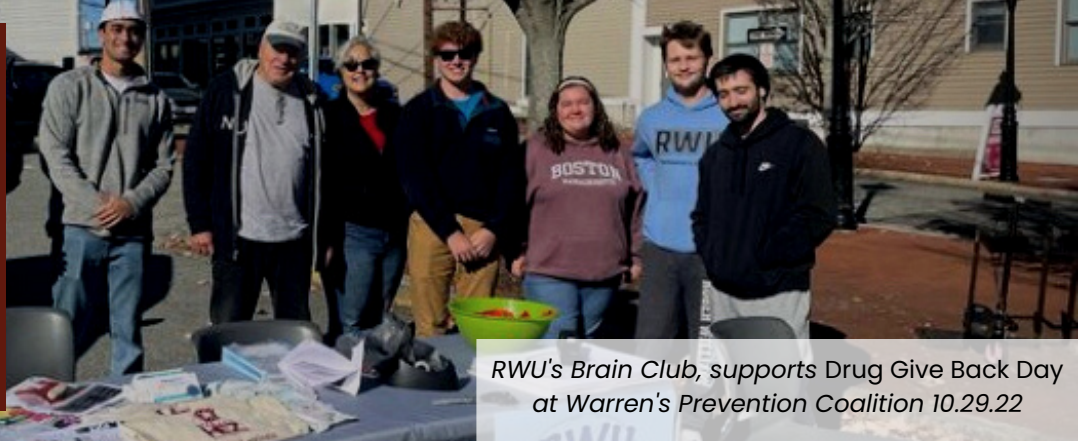
RWU's Brain Club, supports Drug Give Back Day at Warren's Prevention Coalition 10.29.22