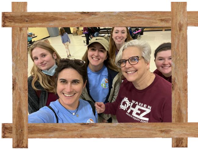
HEZ team poses for a selfie after a successful Family Math & Literacy Night at Hugh Cole Elementary School

Maker's' Tool kits containing tape, scissors, markers and reusable materials were distributed by Warren HEZ & Bristol HEZ at family events held at Colt Andrews and Hugh Cole Elementary Schools in March. The aim was to encourage a "screen break" over spring break.