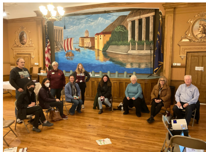
Community Conversations at Jefferson St. Armory & Senior Ctr.