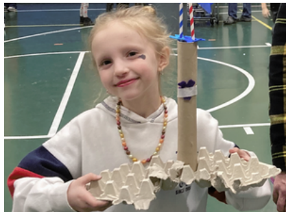
Trash to treasures shared at Science, Math & Literacy Nights