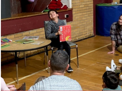
Great readers at Head Start's "Dads Dinner and Dinosaurs"