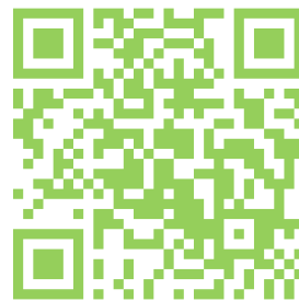
Bristol HEZ Survey