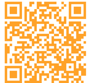
Bristol HEZ FB