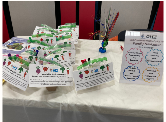
Naomi's table at the Hennessey Kindergarten Orientation, where she met some of the incoming students and their families