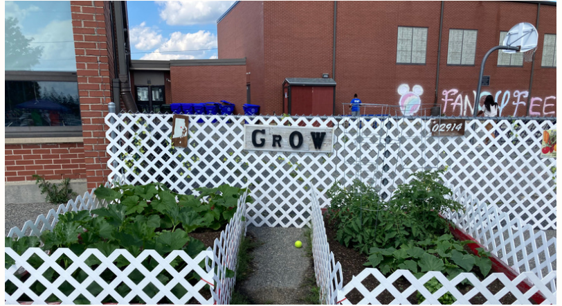
Hennessey garden growing new plants supplied by EPHEZ