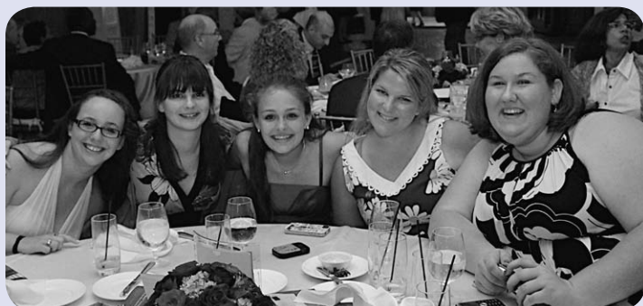
Members of the Trinity Church and St. Columba's Church Youth Groups received a 2011 Vision Award for their contributions of holiday gifts for EBCAP's Clinical Services for Youth clients.