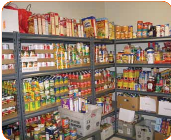
New consumers at EBCAP’s food pantries in Tiverton, Newport, and East Providence are also referred to other departments.

As part of the Newport Family and Child Opportunity Zone (NFCOZ), EBCAP places Family Service Coordinators in all elementary schools in the City of Newport to provide case management, literacy activities and other services to promote positive family/school interactions. Assistance in determining eligibility for RItE Care health insurance and other programs is also provided through NFCOZ.