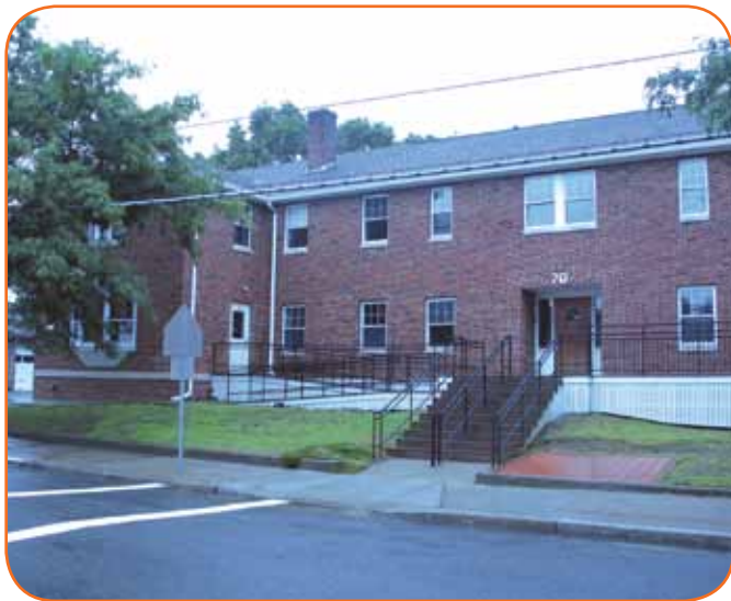
Opened in September of 2010, 70 Turner Avenue in East Providence houses two Head Start classrooms and six service enriched apartments.

Major fund raising efforts were accomplished through the 2009 Bike-a-thon at Colt State Park in Bristol and the annual Welcome Home dinner event, held in 2009 at the Metacomet Country Club in East Providence and in 2010 at the Rhode Island Country Club in Barrington.