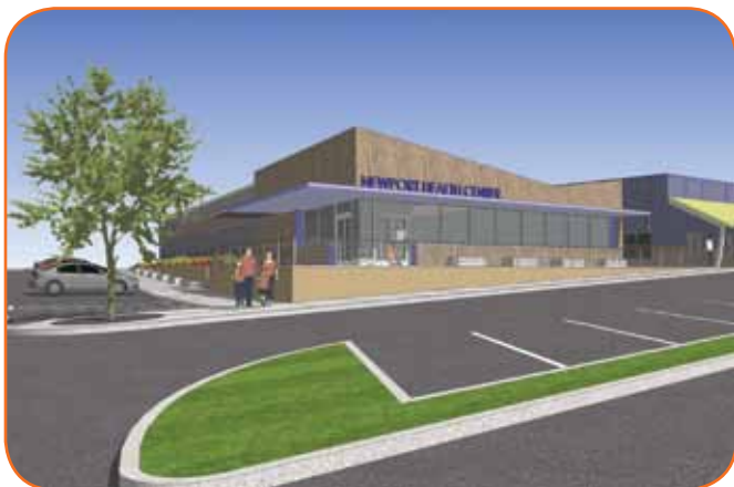
An architect's rendering shows the new EBCAP Health Care Center to be built in Newport's North End in 2011/2012 next to the Head Start Center on Chafee Boulevard.

Professional services have been enhanced by the switch to Electronic Medical Records (EMR) for medical patients, allowing medical staff to see more patients and analyze patient data to help improve service delivery. A recent federal grant to EBCAP and two other Rhode Island health centers, will provide for a switch to electronic dental records.