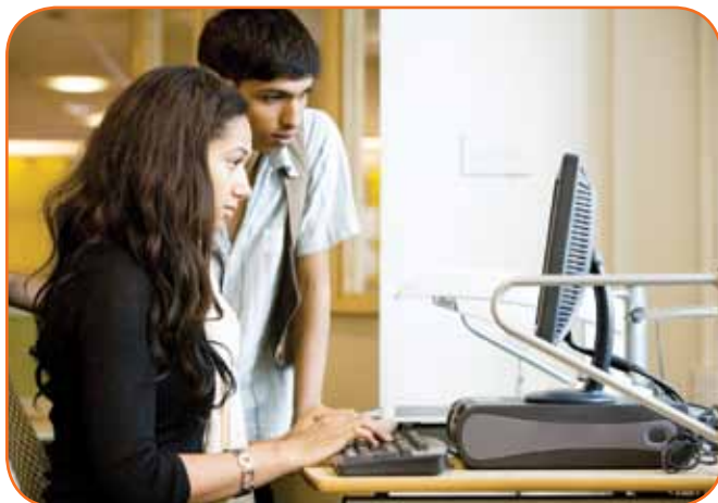
Youth Centers help young people (ages 14-24 years) prepare for employment opportunities with job training, GED preparation, and resume writing.

The Youth Center realized a 100% positive outcome rate, meaning every youth that exited the program had achieved the goals they set during their participation at the center.