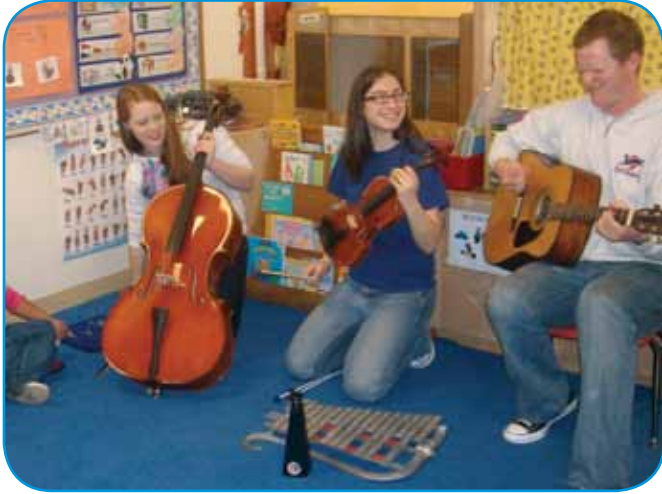
Students from Salve Regina University in Newport were part of the "Touch an Instrument" program at the Chafee Boulevard Head Start Center in Newport, showing children how musical instruments are played.