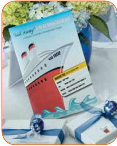
Fundraising event: Invitation to the 2009 Seaside Gala held at Castle Hill Inn and Resort.

The 2009 Seaside Gala was held at Castle Hill Inn and Resort in Newport for the first time and featured a "Cruise Ship" theme. Over 180 guests enjoyed a special Castle Hill dinner, entertainment and live and silent auctions, with over $17,000 in funds raised. The 2010 Seaside Gala featured an American Bandstand theme, with 200 guests and raised over $18,000. The presentation of the 2009 Vision Awards and Public Service Awards was a special highlight at each Gala.