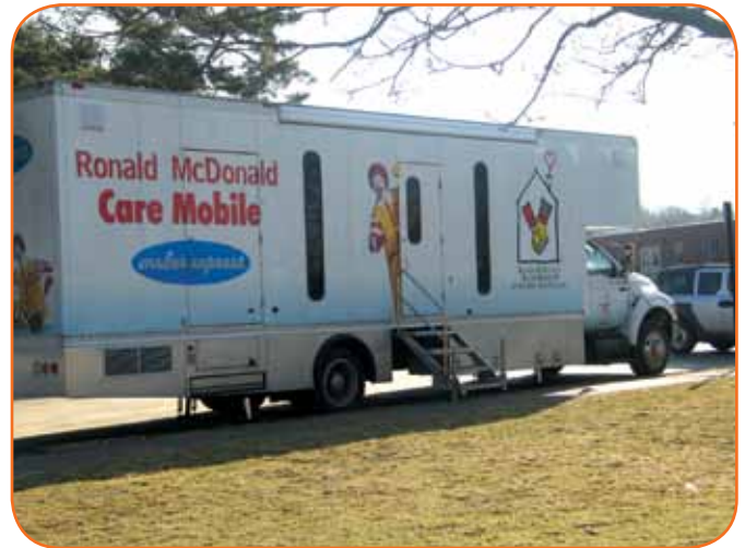
Aboard Molar Express: Now in its fourth year, East Bay school children receive free dental care on the mobile dental center shared by EBCAP and two other health care providers.

The Molar Express partnership has continued to flourish with 791 children seen in 2009 at visits to Head Start classrooms, community agencies and public schools throughout the East Bay. The Smiles Program, which provides dental screenings and cleanings for public school students in the East Bay, also enables children needing more extensive dental care to be served aboard the Molar Express at no charge.