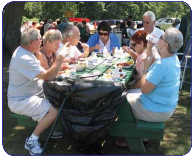
An annual summer picnic at Colt State Park in Bristol is provided for all the senior citizens in the Ocean State Senior Dining Program, along with music and dancing.

The Foster Grandparent Program places elderly residents in public schools, Head Start classrooms and day care programs where they assist children in developing self confidence and skills improvement. In 2010, 18 Foster Grandparent volunteers received The President's Call to Service Award for serving over 4,000 hours of volunteer time. They received a letter signed by President Barack Obama, a certificate and a gold lapel pin.