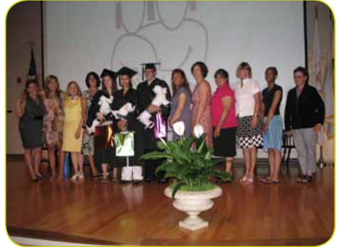
Even Start staff and parents are shown at a graduation ceremony for adults receiving their GED in the program.

In 2009, the program served 33 families in Newport.