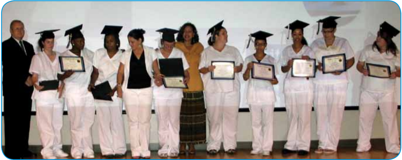
A graduation program was held for students in the CNA (Certified Nursing Assistants) Training Class, part of the Newport Skills Alliance, which prepares employees for opportunities in career growth jobs.