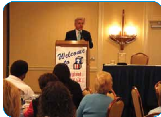
Jack Reed, U.S. Senator for Rhode Island, speaks at the New England Head Start Association Conference held in April of 2010 in Newport, RI.

The Head Start Policy Council, made up of Head Start parents and community representatives, continued its review and action on all program policies and procedures, as well as helping coordinate special events for the children.