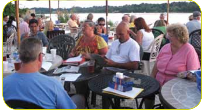
Singing Out Against Hunger committee members hold a planning meeting to get ready for the fund raising event.